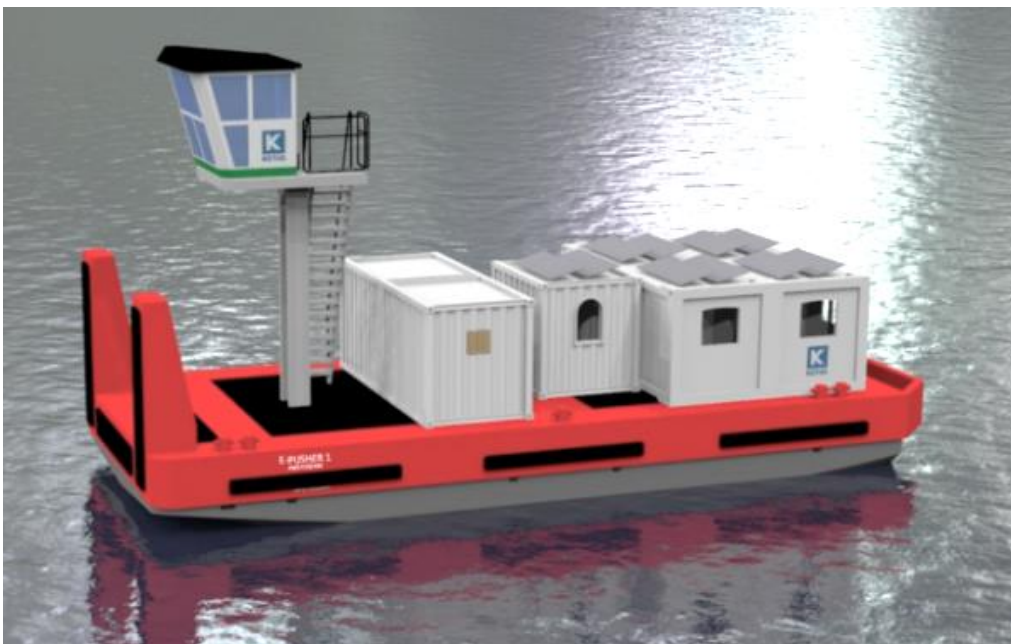
'Kotug' electric pusher tug (Kotug)

The web site https://www.portstrategy.com/greenport announced that a zero-emission tug is being used for shipping coca. The web site https://www.kotug.com/ says a KOTUG E-Pusher type M and four barges will be used for shipping cocoa beans between the Port of Amsterdam, the largest cocoa import port in the world, and their cocoa facilities in Zaandam. The vessel is equipped with swappable battery energy containers from Shift Clean Energy (Shift), which is part of the revolutionary design of the vessel and will utilize Shift's unique battery swapping and charging stations. The operator Cargill claims to have the first fully electrified industrial setup for inland shipping.