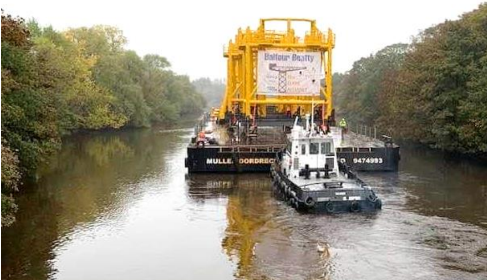
Another consignment for Hinckley was seen being pushed down the River Cart (River Clyde tributary) on the 18th October