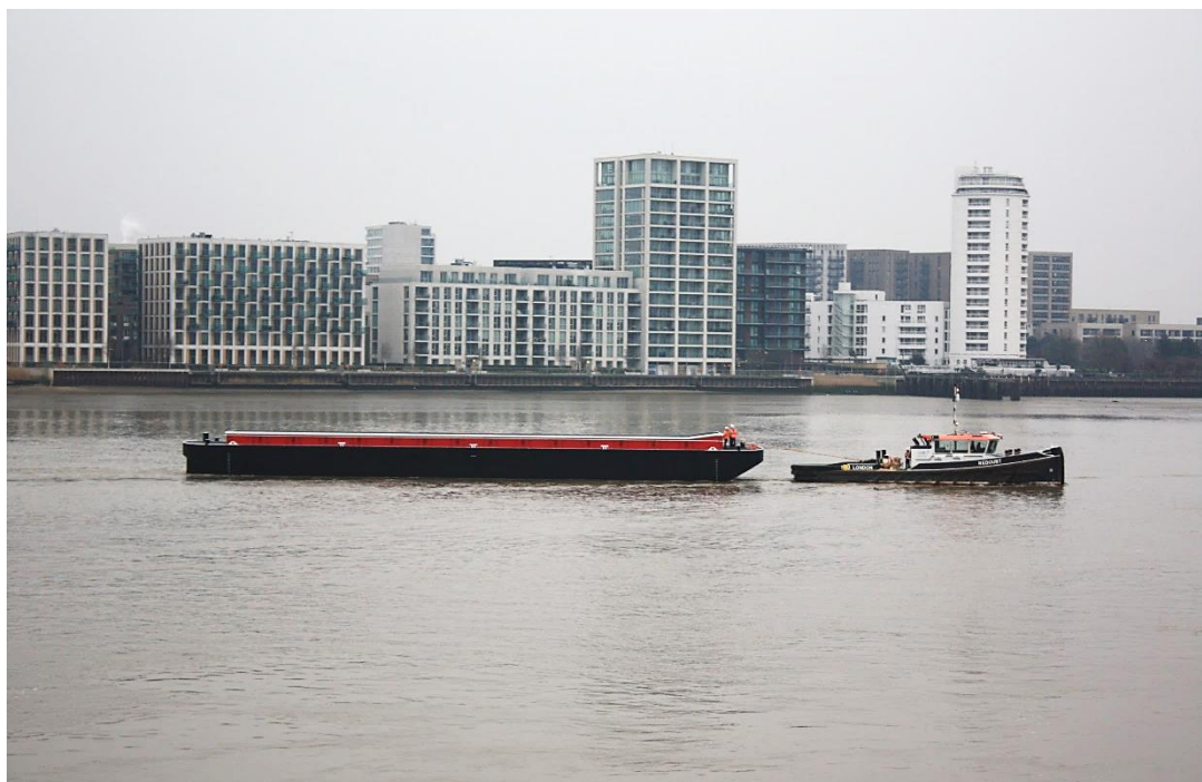
New barge Wm. Cory , named after the company's founder (Cory)

Cory operates a fleet of five tugs, more than 50 barges and more than 1,500 containers, to transport non-recyclable waste from waste transfer stations along the River Thames to Cory's EfW facility in Belvedere and ash resulting from the energy recovery process further down the Thames to Tilbury where it is processed into aggregate for the construction industry. They estimate use of the river removes around 100,000 vehicle journeys from London's roads each year. That is an excellent achievement for water transport, which cannot go unnoticed by our government ministers with their barges passing the Houses of Parliament.